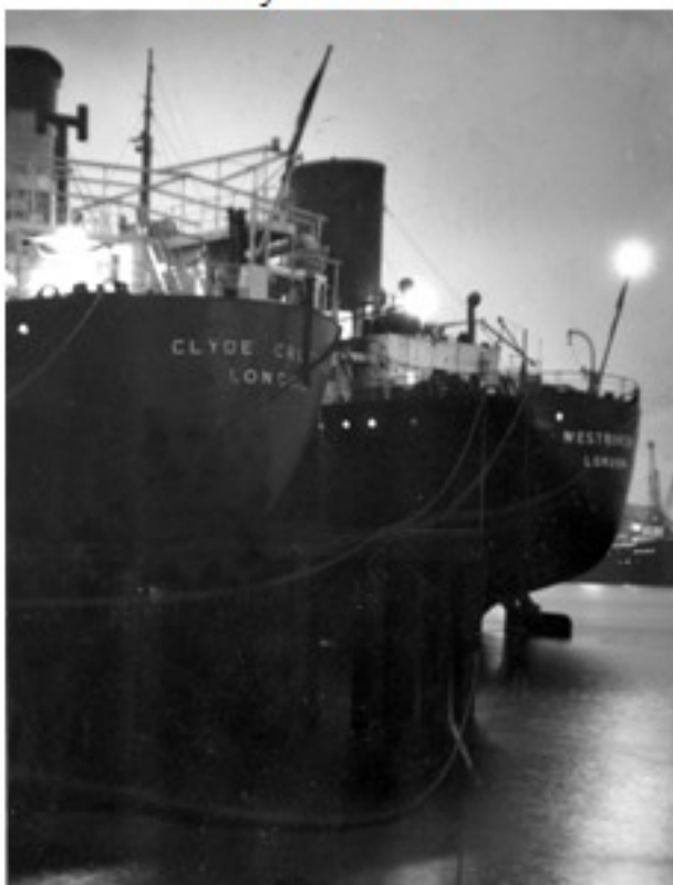
Night Lights 1959