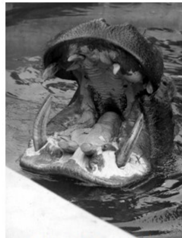
Dentist's Dilemma. 1958