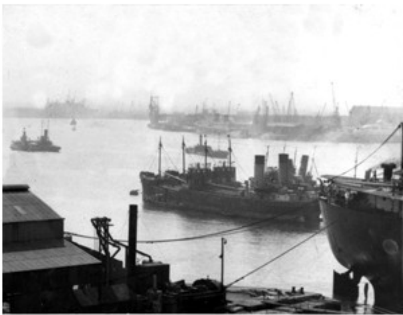
Busy River 1958