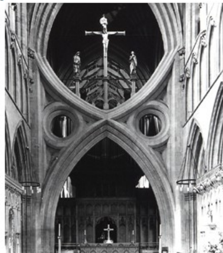
The High Alter Wells Cathedral