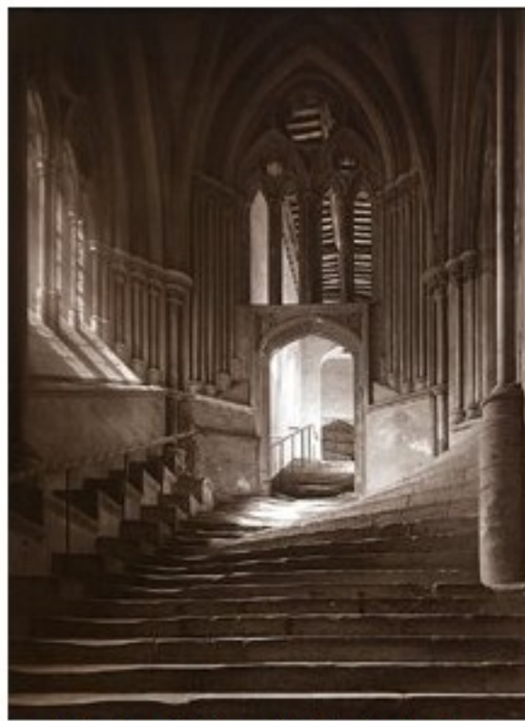
Chapter Stairs Wells Cathedral

Amongst his many other photographic talents he was also an accredited judge and lecturer throughout Northern England where he travelled to many clubs giving his time for the benefit of others and was always willing to offer help and assistance, he is with out doubt acknowledged to have been one of the finest Ambassadors that South Shields Photographic Society has ever had.