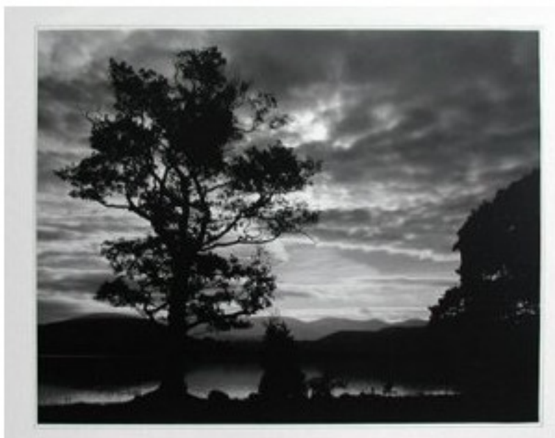
Morning Light Bassenthwait (1994)