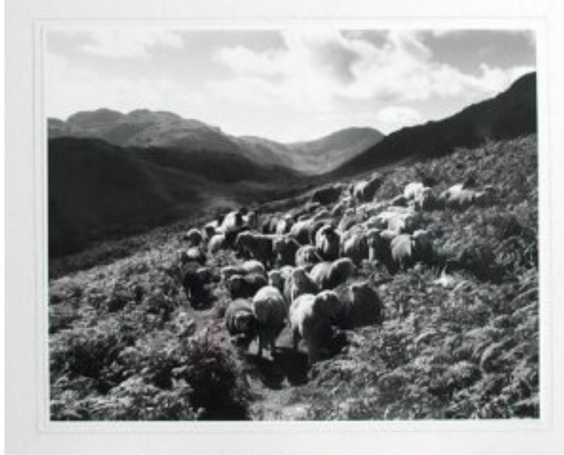
Tuppin Time (1994 2nd place)